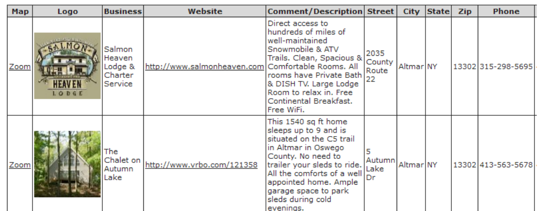
Listing Information from Search in the Web Map (sample portion, lodging)